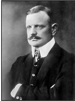
Jean Sibelius, Composer, Finland Composer of Finlandia Rotary Club of Helsinki-Helsingfors