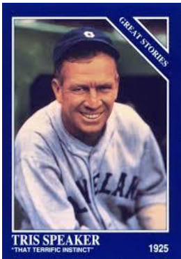
Tris Speaker, Baseball Player, USA Inducted into the Baseball Hall of Fame in 1937 Rotary Club of Cleveland, Ohio

He occasionally did color on Cleveland Indians game when I was a kid.