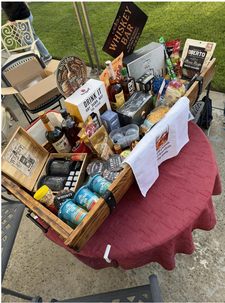
The finished product, our Whiskey Barrel for the District Conference!! A great 4-club team effort!!