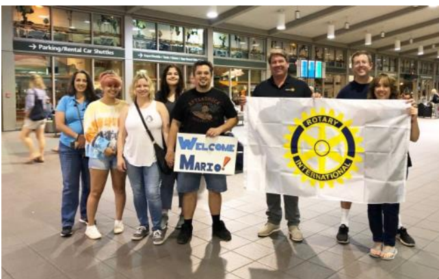
At the Airport