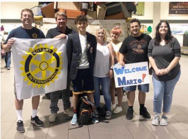
At the Airport