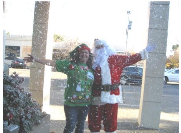
Santa and one of his elves.