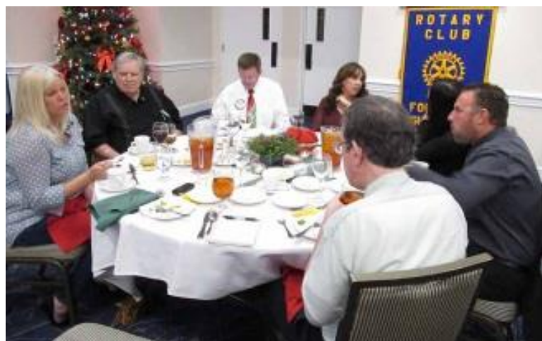
Rotarians and their Guests enjoying dinner