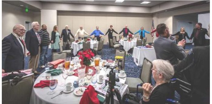
Circle of Friendship