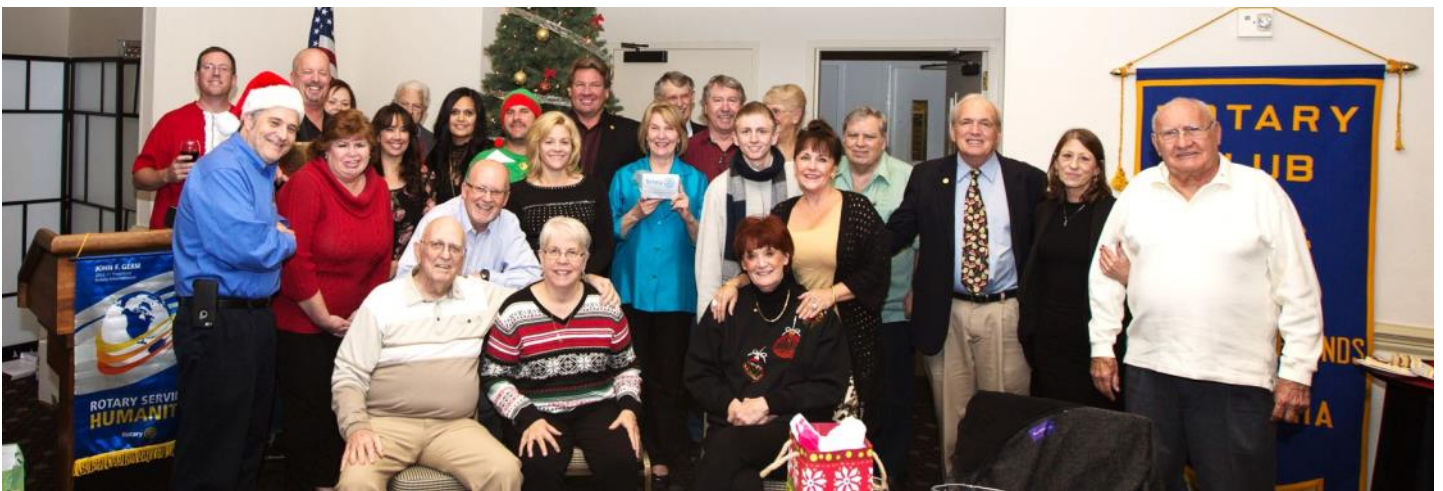
Rotary Club of Foothill-Highlands Family