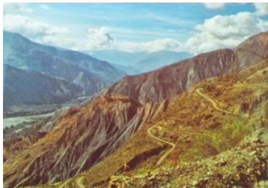
Road to Project Site