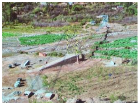
Another Example of the Bridges Being Constructed to Help Inhabitants Cross the Rivers Created by the Rainfall