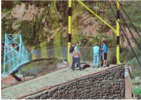
Suspended Foot Bridge