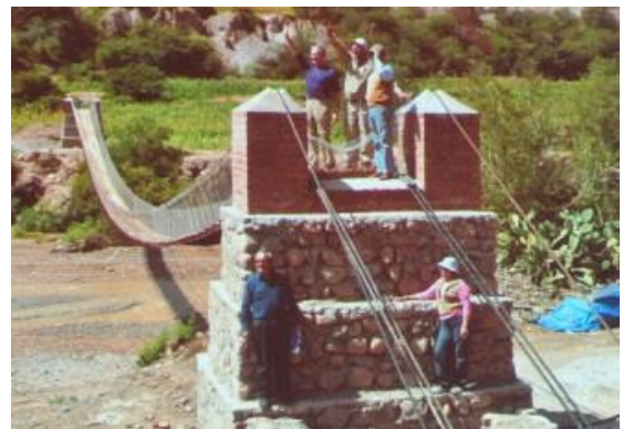
Suspension Foot Bridge

supported by towers on each bank, strong cables and chain-link sides buttressed by bars. Pedestrians walk on wooden 2-by-8s laid end to end, which provide a sturdy and stable surface.