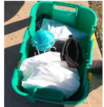
NFI (Non Food Items) boxes