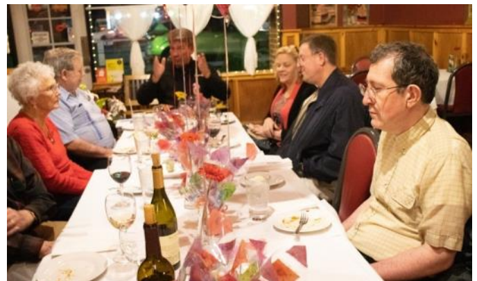
Rotarians and guests enjoying fellowship