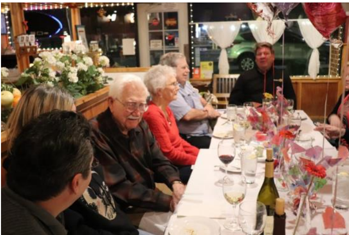
Rotarians and guests enjoying fellowship