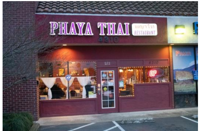
Phaya Thai Restaurant