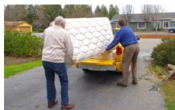
Joe and Dominic loading the truck