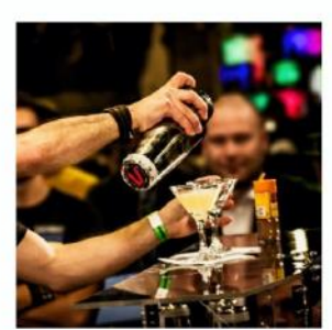
Support Celebrity Drink Mixer

Join for an evening of meeting other local business professionals while supporting our Celebrity bartenders as they compete for the most tips. Proceeds will support an upcoming Stop Hunger Now food packaging event.