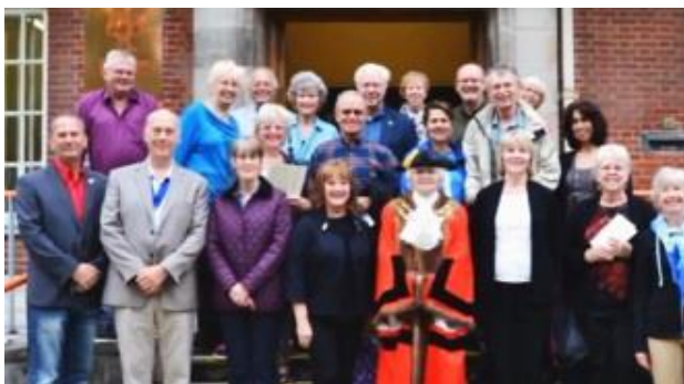
The Rotarians, spouses and friends on the Rotary Fellowship Exchange to Swindon England in September 2014.