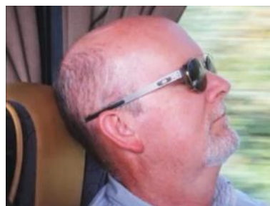
It was a long trip