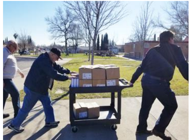
Rotarians at work