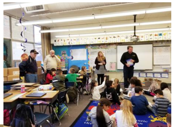
Roland obtained the children's promises to learn one new word each day