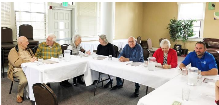
Rotarians and friends enjoying lunch at the Plates Cafe