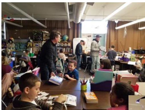
Handing out the books