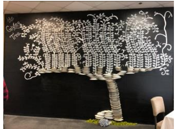
Art work by participant's of the Saint John's Program at the Plates Cafe