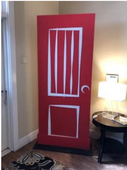
Art work by participant's of the Saint John's Program