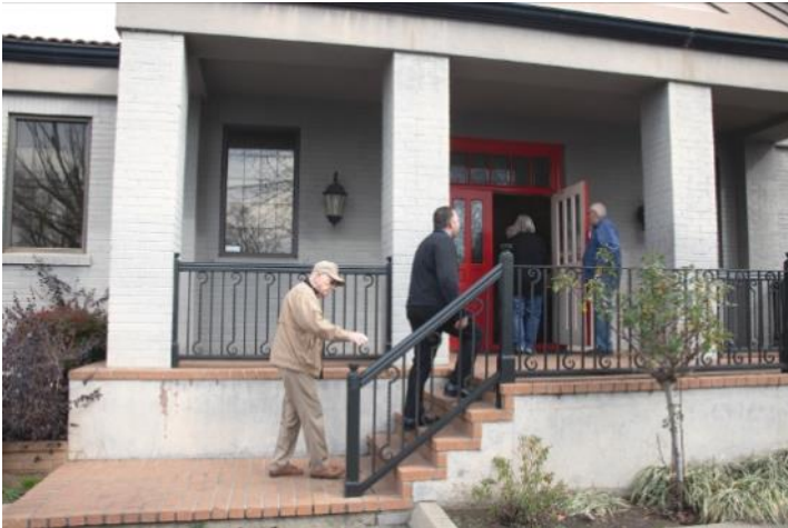
Rotarians and friends entering Saint John's center.