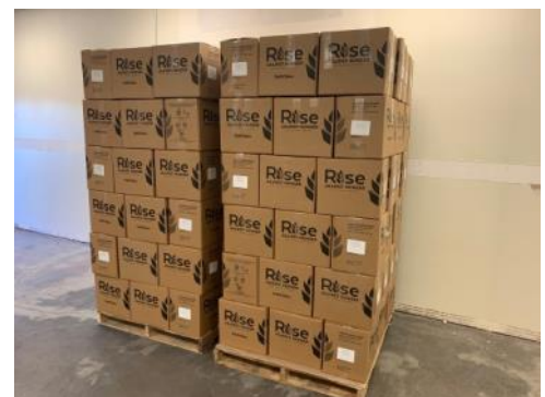
Boxed and ready to ship.