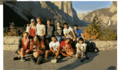
D5180 RYE 2017-18 Inbounds