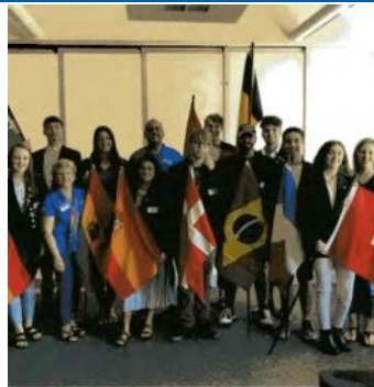
D5180 RYE 2018-19 Outbounds