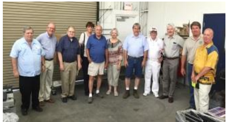
Rotarians touring Newlife Electronics