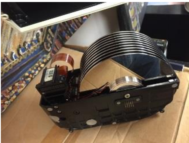
The inside of an "early" hard drive