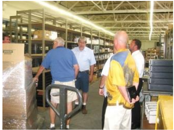
Rotarians touring Newlife Electronics