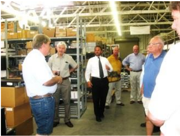
Rotarians touring Newlife Electronics