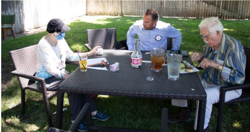
Members and guests enjoying food and fellowship.