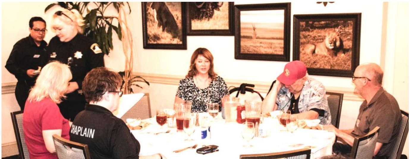
Rotarians and guests enjoying food and fellowship