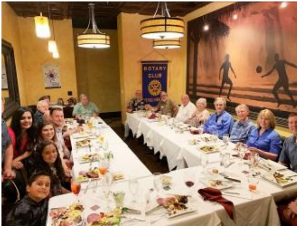
Rotarians and friends enjoying dinner