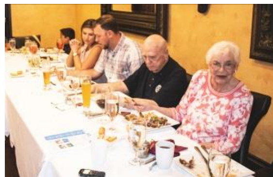
Rotarians and friends enjoying dinner