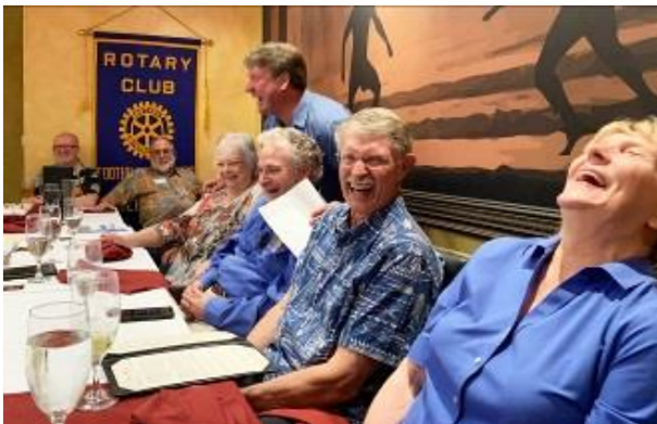
Rotarians and friends having fun