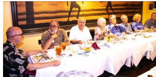
Rotarians and friends enjoying dinner