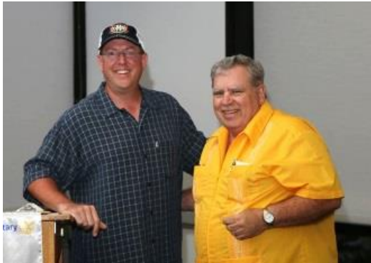
Presidents' spouses exchanged pins.