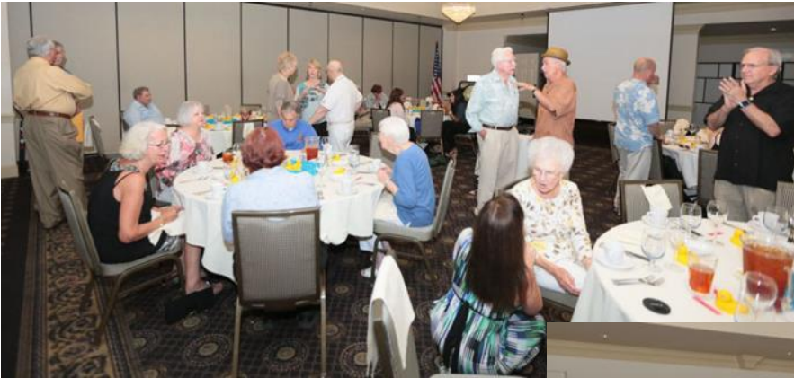
Rotarians and their Guests enjoying great fellowship