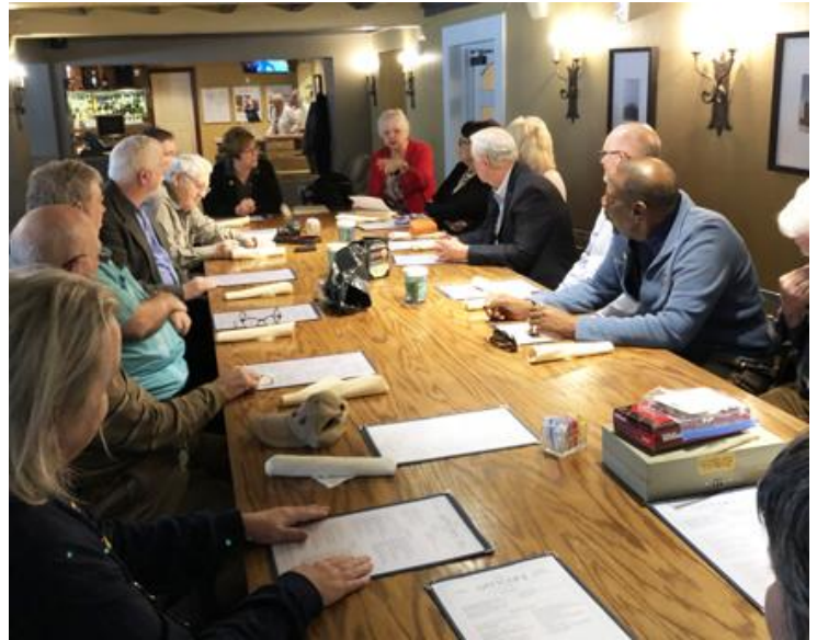
Rotarians and friends