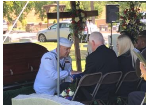
Flag presentation by U.S. Navy personnel