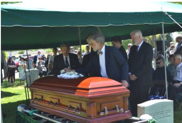
Family saying goodbye