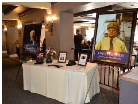
Lunch after service at the Lions Gate Hotel, in the Officers Club