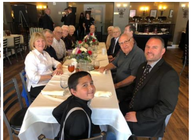
Rotarians and guests at the lunch