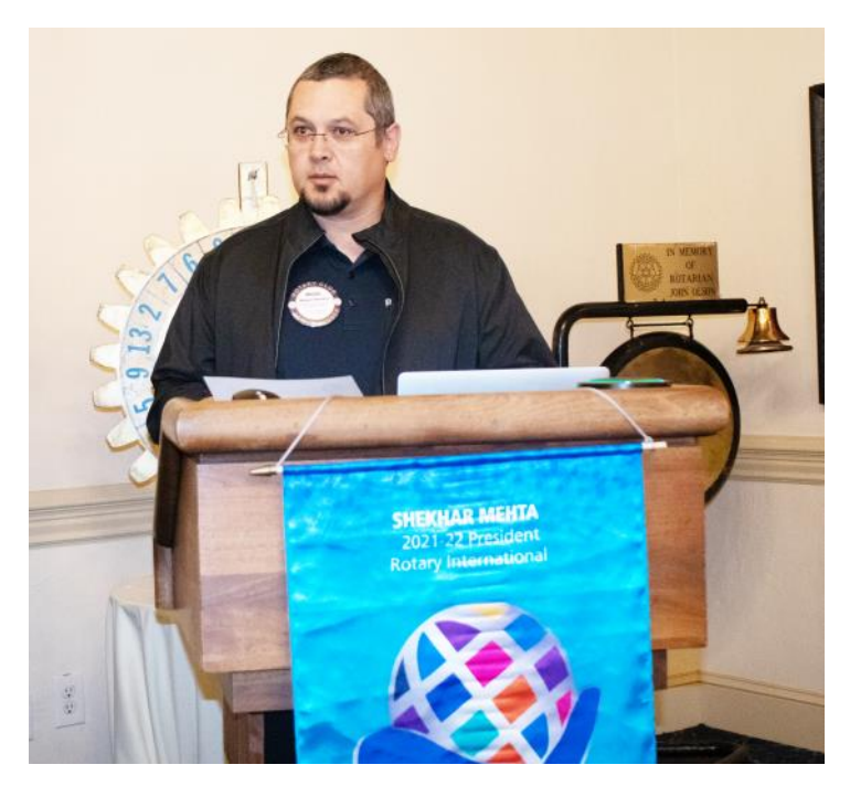
PE Miguel looking Presidential

★ The Rotary Foundation Endowment https://www.youtube.com/watch? v=Y4 ktNV6zoo