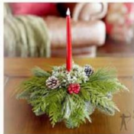
Item # Order Name C5M Gift Centerpiece With LED Candle