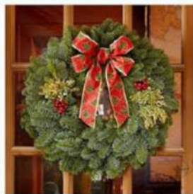
Item # Order Name W4M 22" Mixed Evergreen Gift Wreath

Perfect gifts with a personalized holiday message, will arrive directly to recipient fresh within the first two weeks after Thanksgiving.