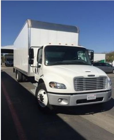
Patrick arranged the use of a big rental truck from Enterprise