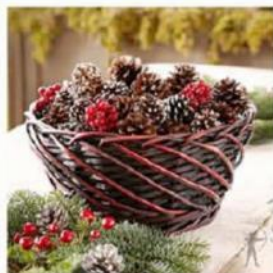
Item # Order Name N7M Rustic Pine Cone Gift Basket