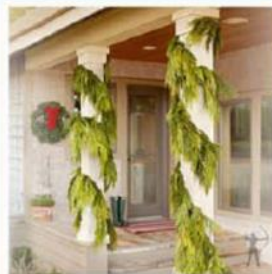
Item # Order Name G3M Western Cedar Gift Garlands