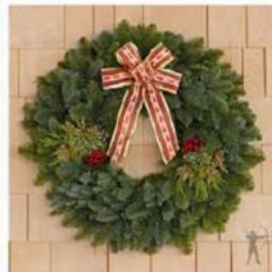
Item # Order Name W3M 28" Mixed Evergreen Gift Wreath