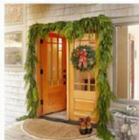
Item # Order Name EGM Evergreen Gift Set