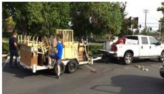
Dominic's son Nick was a big help at the end of the day loading items to be returned to storage