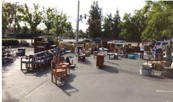
Getting ready for the crowds