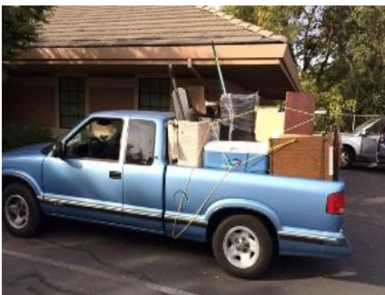
Loading up to return unsold items to storage