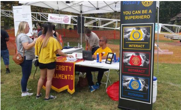
Rotaract Information Booth at the BrewFest