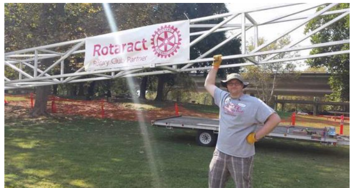
Holding up the Teeter Totter