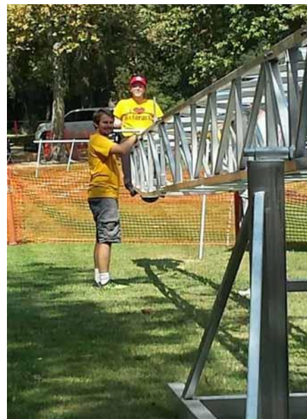
Giving the Teeter Totter a Test Run prior to the Event Opening