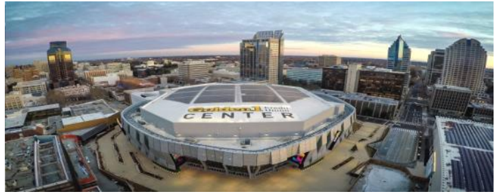
Golden One Center

EIN 68-0392810, PayPal link on Club Website: http://www.foothillhighlandsrotary.org/