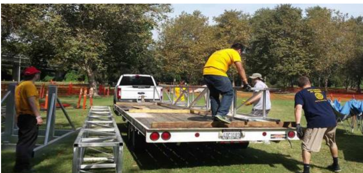
Unloading the WORLD'S LONGEST TEETER TOTTER