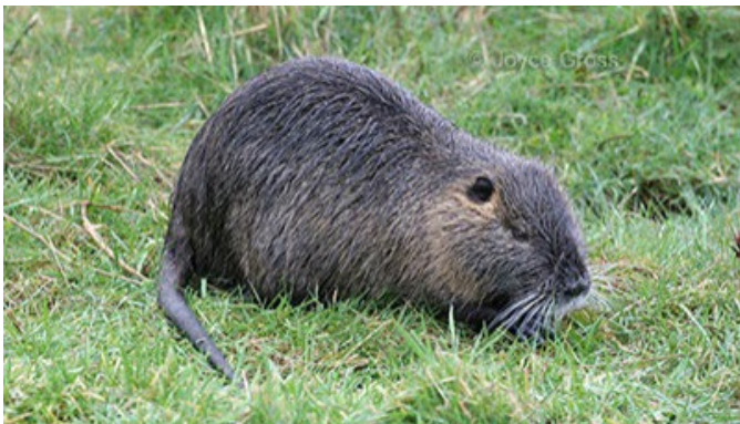
Nutria