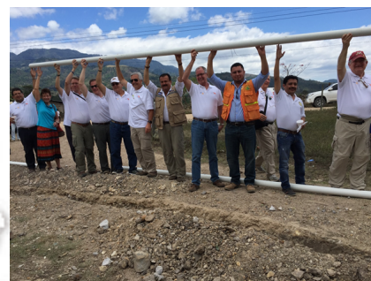
Rotarians and World Vision holding up pipe in the prior grant that was part of 87 miles of piping in trenches dug by 1,000 community members.