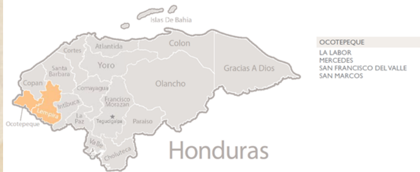
Honduras WASH Rotary project municipalities by department:

The project will focus in the Western region of Honduras within the Ocotepeque department. Specifically, we will be targeting the municipalities of La Labor, Mercedes, San Francisco del Valle, and San Marcos.