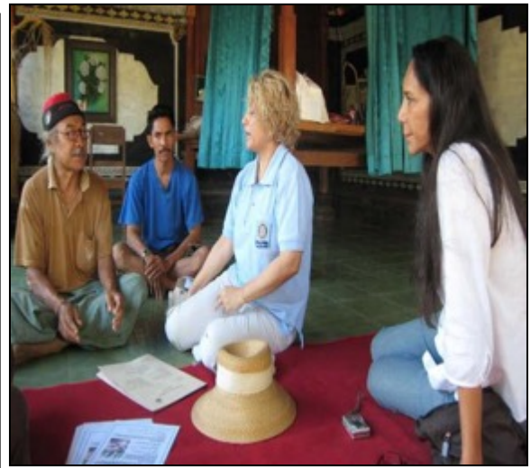
Leprosy Eradication & Detection Program, Karangasem, Bali NGO - Yayasan Putri Bali - MG # 68240 US$ 16,500 (2009-2011)