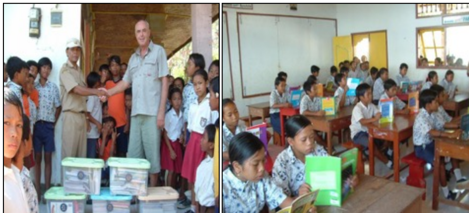
Malaria Eradication, West Sumba NGO – Sumba Foundation MG # 63074 - US$ 49,791 (2007-2008)