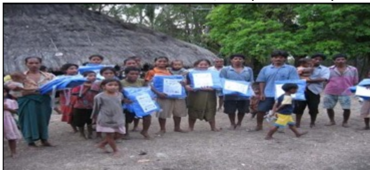
250 Water Filters, Sibang, Bali RCBS Project - MG # 64782 US$ 12,150 (2008-2009)