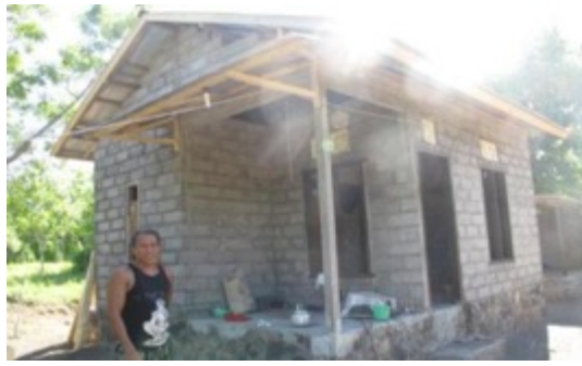
Goat pilot project for poor Nusa Penida farmers. (50 goats)