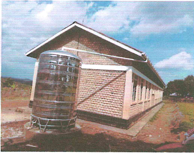
Figure 1. Bujubuli Primary School