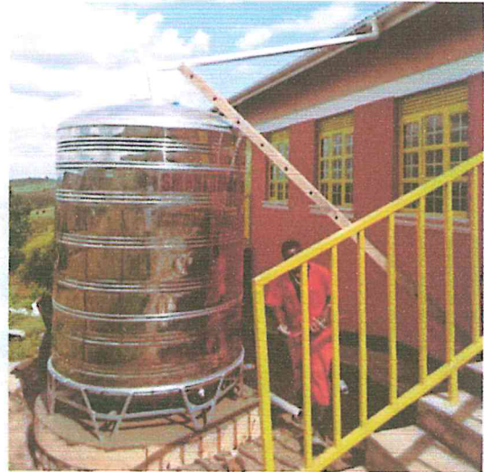
Figure 2. Kaborogota Primary School