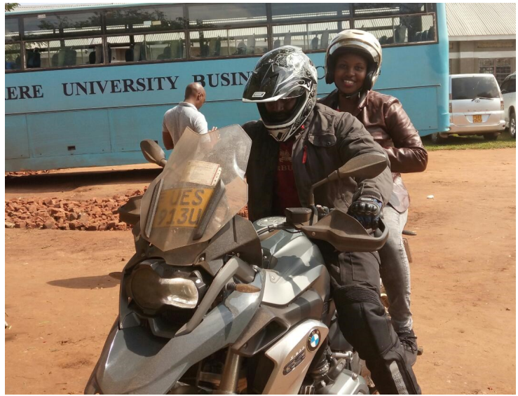
Club members used various means of transport to get to Kikandwa.