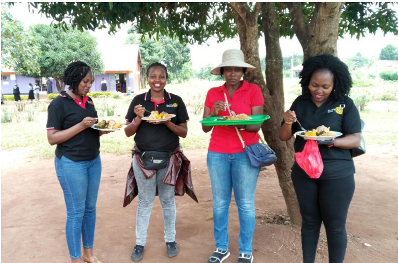
Club ladies, share a meal after a long day of work.