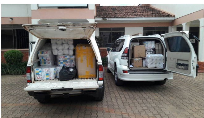
A typical rotary health day commences with loading of drugs from the various partners, ready to treat and serve the community.