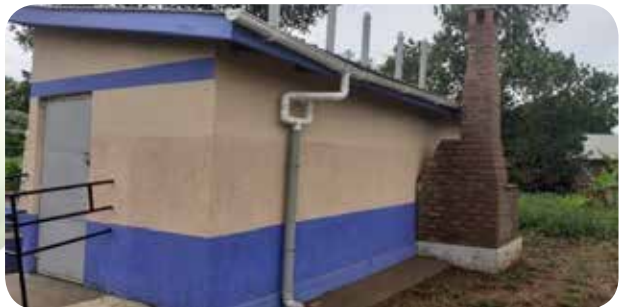
Sanitation facility with an incinerator