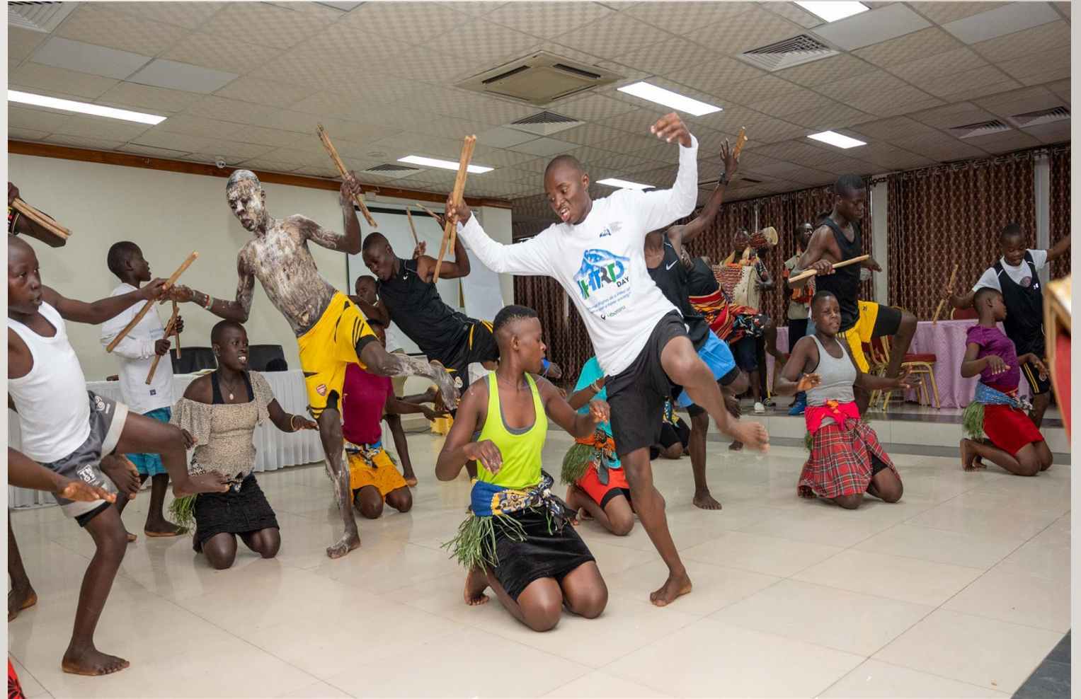
Mukki Dance Troup entertain guests at Hotel Africana