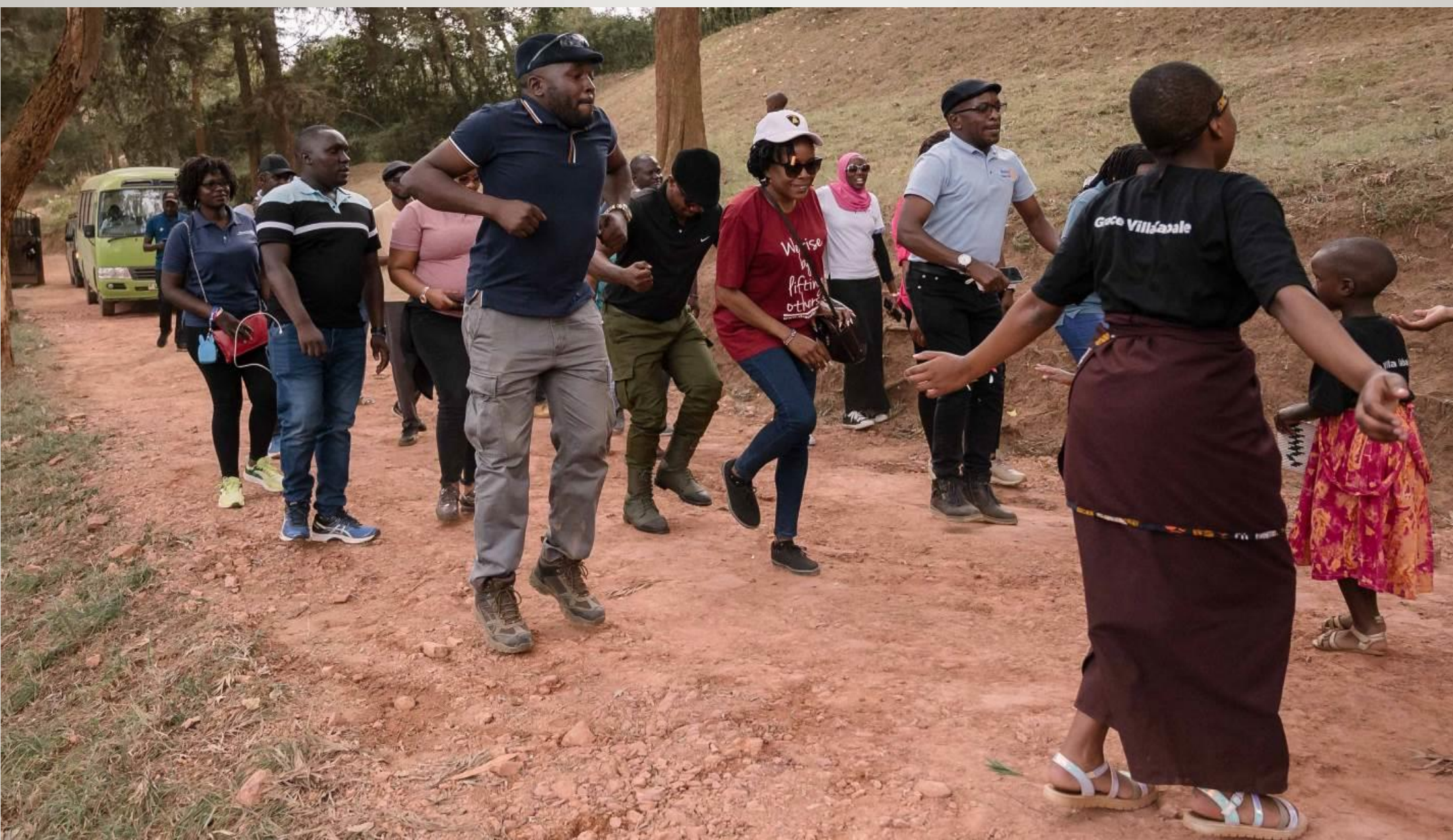
The scintillating performance from the girls at Grace Villa got everyone dancing