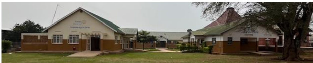
2024 Completed Health Center