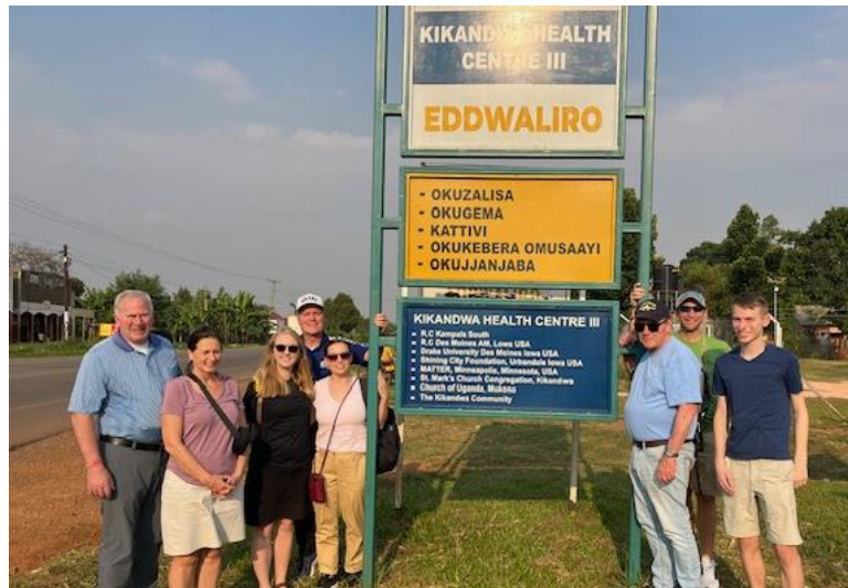
Kikandwa Health Center Rotary Health Day and Global Grant Deployment