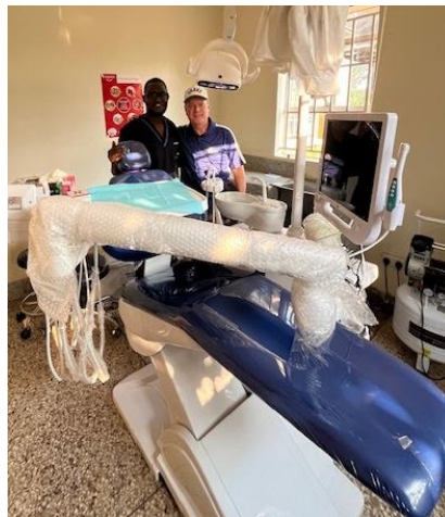
Dental Chair provided by SCF