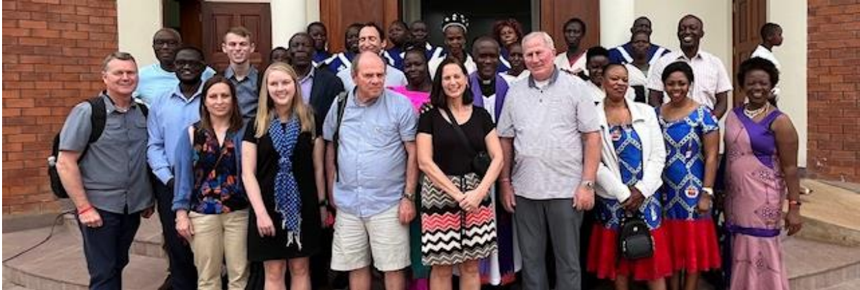
Fellowship and Worship at St. Mark Kikandwa Church of Uganda, Mukono Diocese.