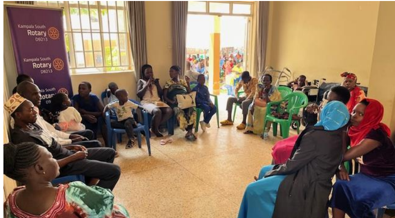
Reception Area to see the dentist.