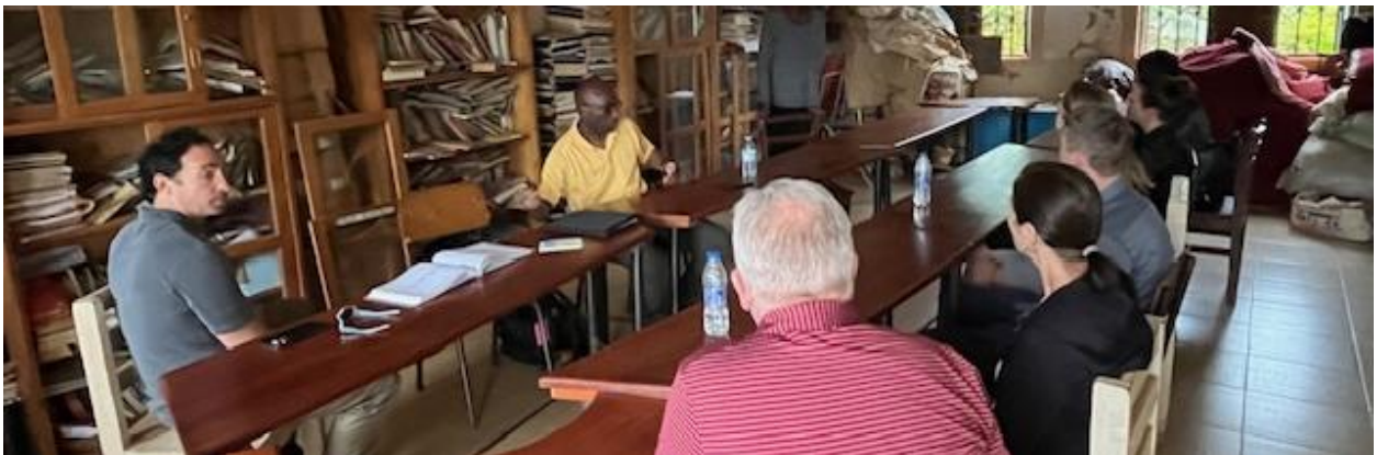
Site visit at Sure Prospects School with RC Kampala Sunrise.