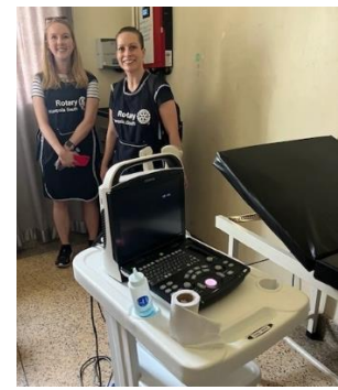
New Ultrasound machine provided through RCDMAM / RCKS / SCF / RI Global Grant (five clinics impacted)