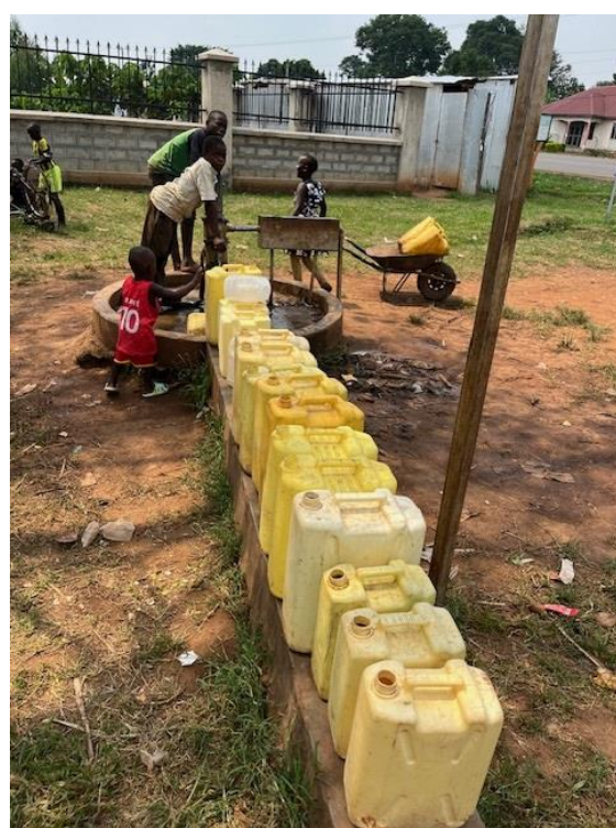
RCDMAM funded water well provides water into all 3 Health Center buildings and a public well.