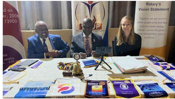
Rotary Clkb of Kampala Sunrise planning meeting.