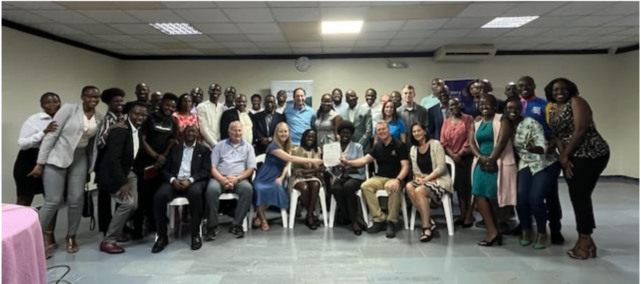
Ledaship from RC Kampala South and RC DMAM with the original MOU signed in 2013 to facilitate building of the Kikandwa Health Center and other related projects.