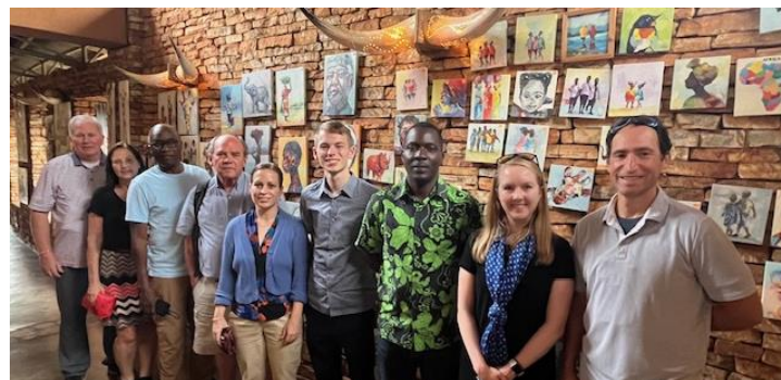
Godfrey's art has been on permanent display at the Kampala National Art Center since 2018.