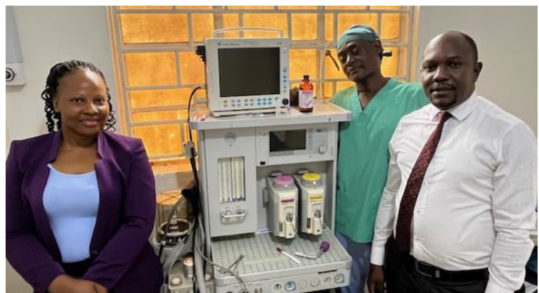
Mukono Hospital dental equipment and anesthesia machine provided by RCDMAM and SCF following 2018 planning trip.