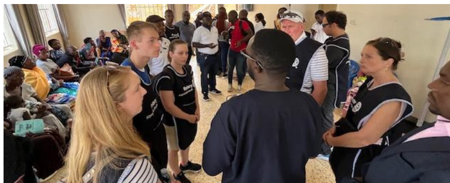
Clinic Tour – Reception / Intake Area