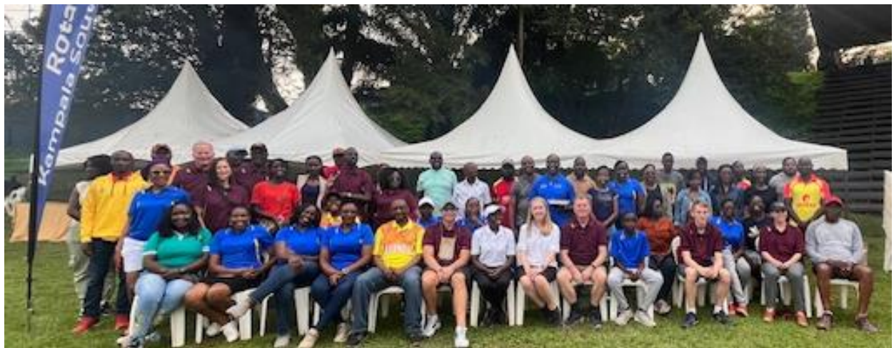
Final fellowship with members of RC Kampala South and the Ugandan National Cricket Team.