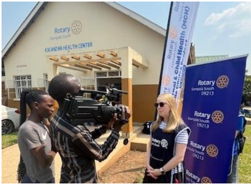
Three national news stories cover the Kikandwa Health Center Rotary Health Day and the Maternal Health Global Grant.