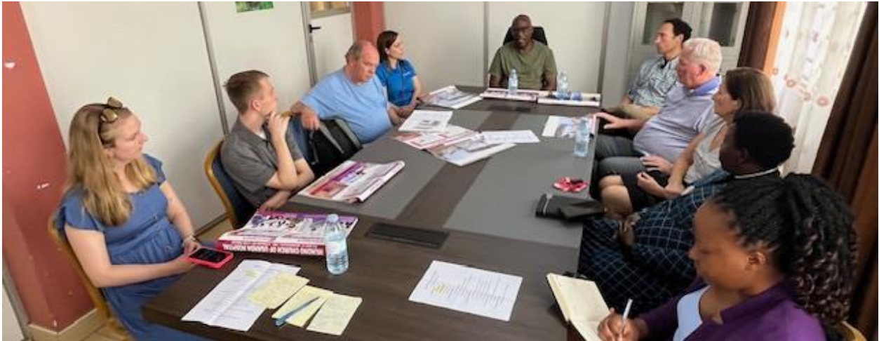
Site Visit and planning session at Mukono Hospital.