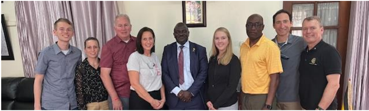
Meeting with Hon. Edward Katumba Wamala, Uganda Minister of Works and Transport.