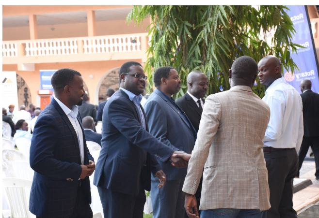
The welcoming committee was composed largely of the fine gentlemen of the club