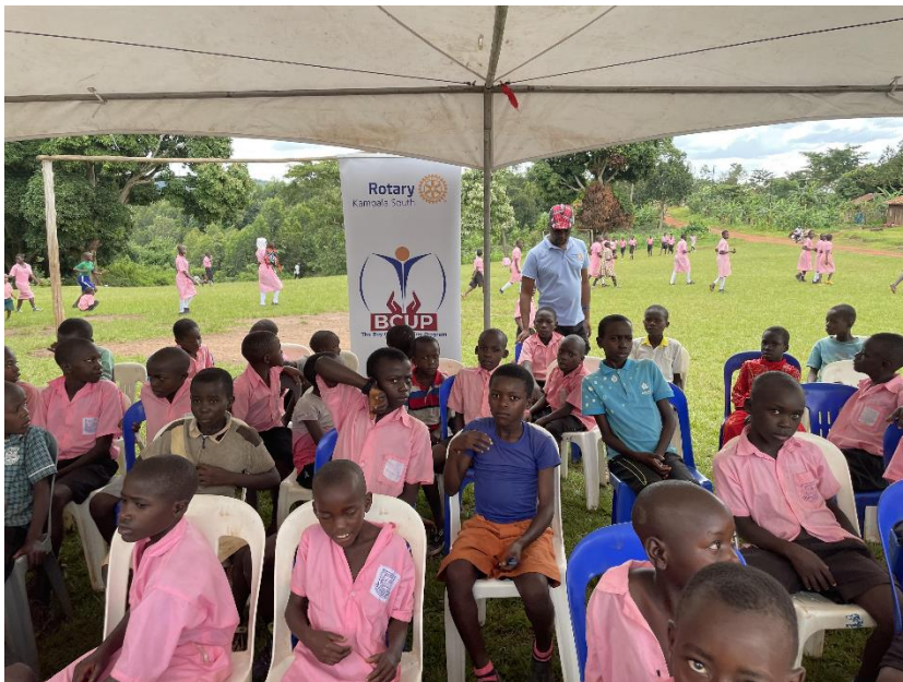
Member of the RC Kampala South BCUP Committee with the learners/boy children