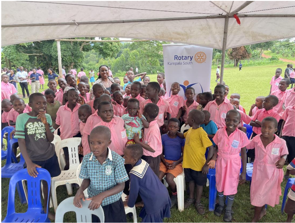
Learners interacting with the BCUP Kampala South Chair after the BCUP Session