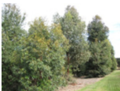
Gum Trees Growing July 2011

The Friends of the Gold Coast Regional Botanic Gardens will have their next Community Planting Day to celebrate National Tree Day, Sun. 31 July.