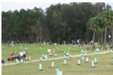
Gum Tree Planting July 2008

The Friends of the Gold Coast Regional Botanic Gardens will have their next Community Planting Day to celebrate National Tree Day, Sun. 31 July.