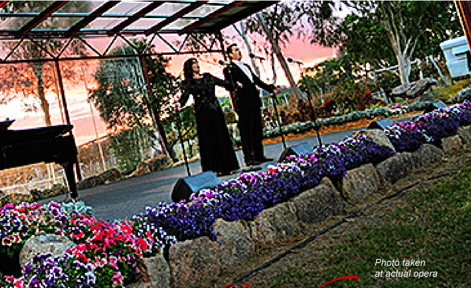
Photo taken at actual opera