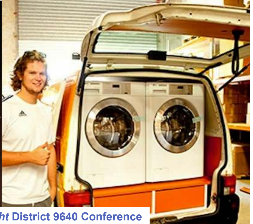
The First Light District 9640 Conference