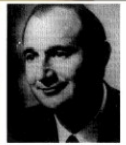
President RC of CT 1983/4