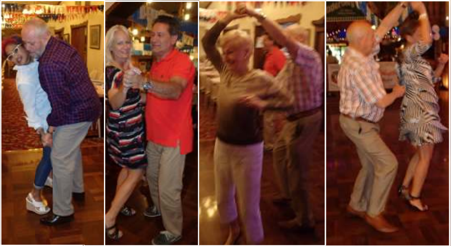
Rock' and Rollin' at our birthday dinner at the German Club's Oktoberfest