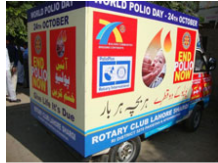
Rotarians are getting ready to spread the word about World Polio Day, 24 October, and the need to finish the job of eradicating the disease.

Rotarians around the globe are planning events to raise polio eradication awareness and funding for World Polio Day on 24 October.