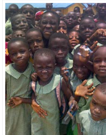
Children wait to use toilets at a primary school in Lagos, Nigeria.