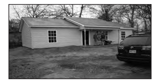
701 Katie Ave.