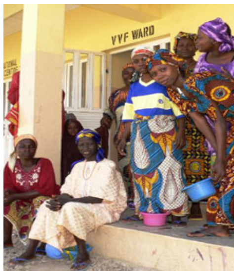
Former fistula patients in Nigeria.

That's why the Rotarian Action Group for Population Growth and Sustainable Development targeted the northern Nigerian states of Kaduna and Kano with a pilot program aimed at reducing maternal mortality by preventing and treating obstetric fistula, a serious birth injury. From 2005 until 2010, the project, partly supported by a grant from The Rotary Foundation, reduced maternal death by 60 percent in participating hospitals, reached 1 million women of childbearing age, and repaired obstetric fistulas for 1,500 Nigerian women.