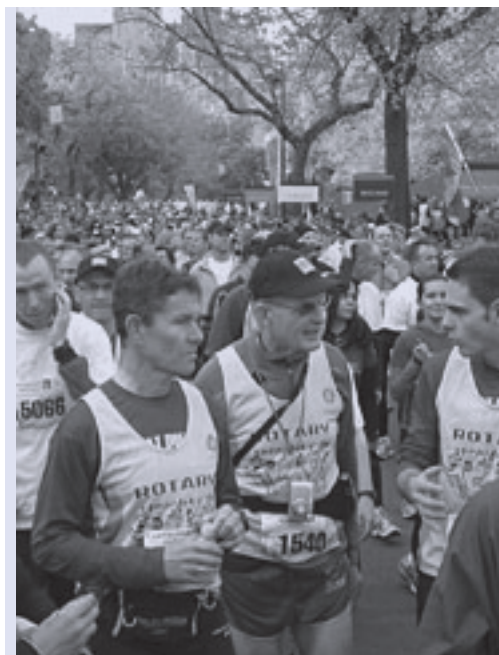
Above: About 150 Rotarians and their families gathered for the New York City marathon in November to promote Rotary and raise $3,500 for PolioPlus. Below: Fellowship members from countries including France, Germany, and Tunisia wore Rotary shirts and shorts during a friendship run before the marathon.

The Rotarian Fellowship of Quilters and Fiber Artists plans to lend its talents to the cause during the 2009 RI Convention in Birmingham, England, 21-24 June. Rotarian quilters will auction off hand-made quilts, with proceeds going toward polio eradication. Last year, the group raised $3,000 for polio during the RI Convention in Los Angeles. This year's convention attendees can visit the fellowship's booth or check its Web site for more information.