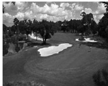
The Bridges Golf Course

Following the golf tournament, conferences are invited to an evening cookout at The Bridges. The cost for the Thursday evening social is $29 per person.