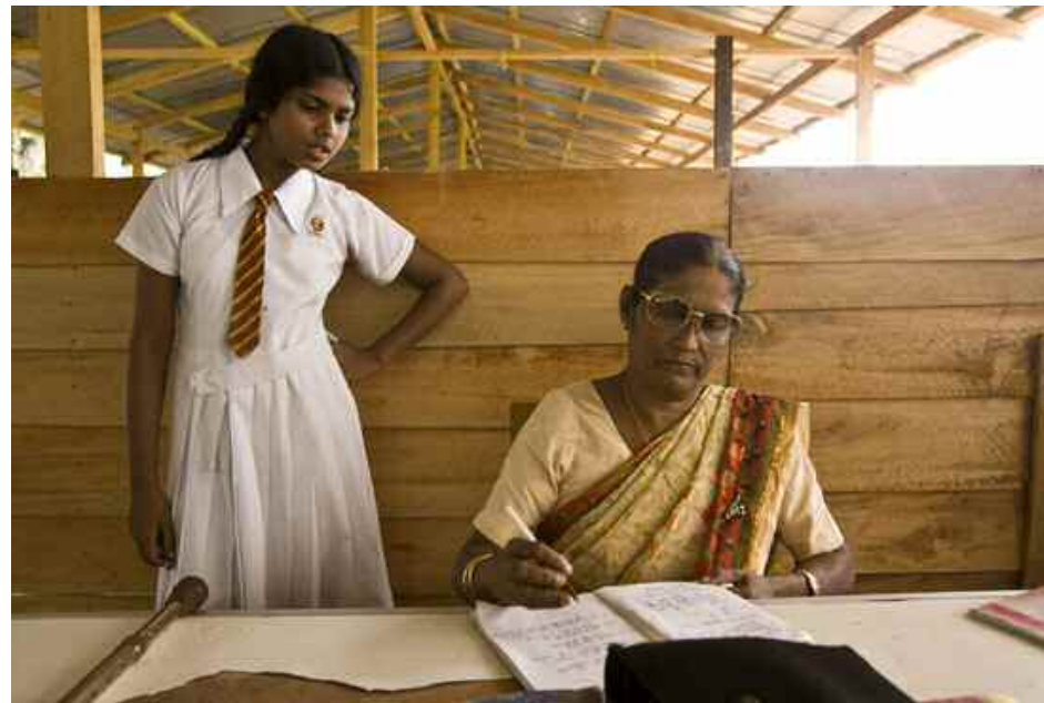
A student looks on as her teacher checks an assignment in a temporary classroom in Sri Lanka, which served 200 students during construction of Randombe Kanishta Vidyalaya, a school in Ambalangoda. The effort was part of the Schools Reawaken project, which helped rebuild 22 coastal schools damaged or destroyed by the 2004 tsunami.

Rotary International News -- 7 March 2012