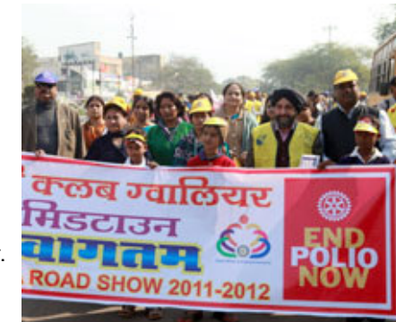
The All India End Polio Now Road Show, organized by District 3201 (parts of Kerala and Tamil Nadu), inspired support for polio eradication in India, Nepal, and Bhutan in late 2011 and early 2012.

The World Health Organization has officially removed India from the list of polio-endemic countries. Ghulam Nabi Azad, India's minister of Health and Family Welfare, made the announcement at the Polio Summit 2012 in New Delhi on 25 February. Azad said that he had been informed of WHO's action by its director-general, Dr. Margaret Chan.