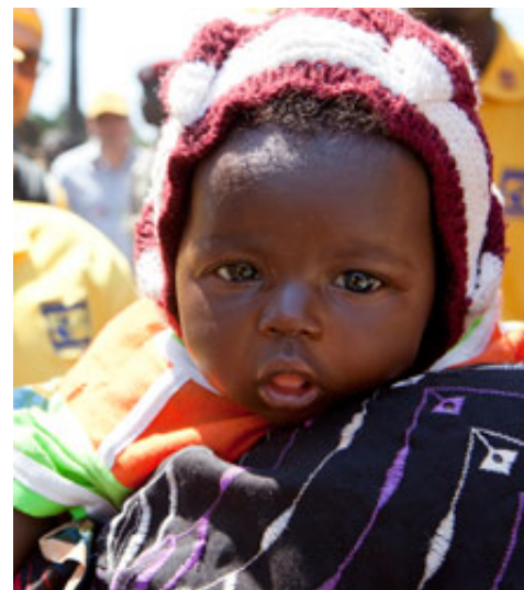
Although this child in Chad has been immunized against polio, others in the central African nation -- and those everywhere -- remain vulnerable to the disease until it is eradicated worldwide.

The plan aims to boost vaccination coverage in the three remaining polio-endemic countries -- Nigeria, Pakistan, and Afghanistan -- to levels needed to stop polio transmission. Health ministers meeting at the World Health Assembly in Geneva adopted a resolution on 25 May that declared "the completion of polio eradication to be a programmatic emergency for global public health."